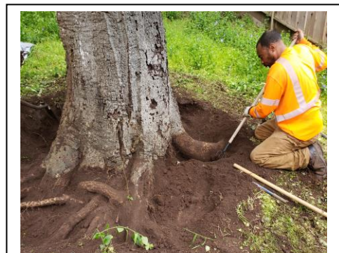
Manual root crown exam to determine extent of decay.

Forest fires are another major concern with need for recommendations to include clearing of trees and brush within a 30 - 100-foot distance of the structures to create a “defensible space”. Obviously, the more distance the better, and some trees and shrubs are more flammable and therefore more important to clear than others. Even beyond this defensible range, clearing of deadwood and lower limbs can prevent the “ladder effect” of fire transferring from grasses and shrubbery to the tree canopies and roofs of structures.